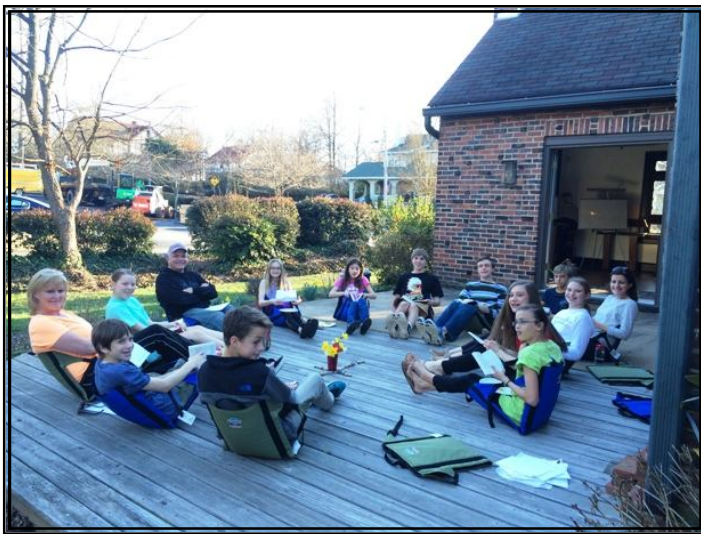
Worship during Episcopal Youth Community

EYC this month in the Little House from 5:00-6:30PM! Throughout April we will focus on the theme “ Seeing God’s Creation in New Places ”. God is at work in the world in some wonderful ways. How will you join in?