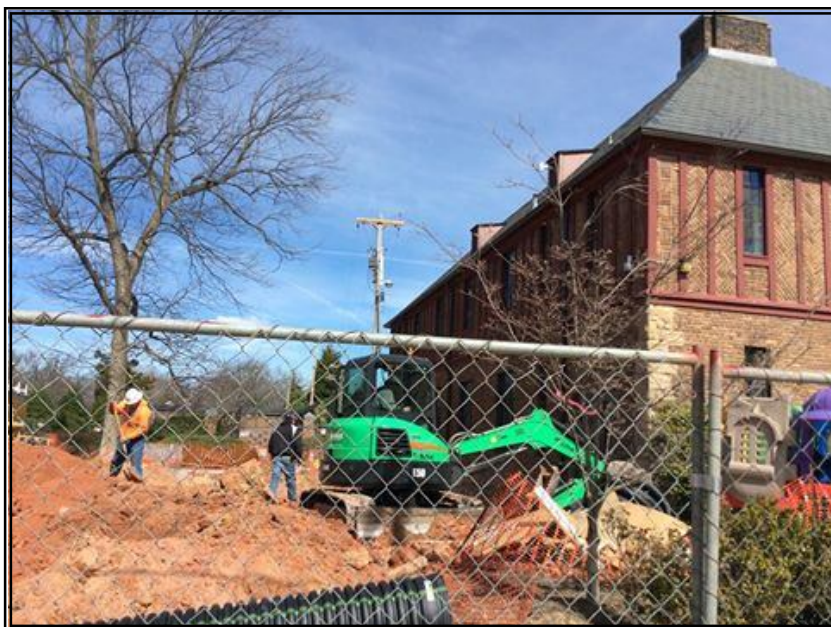
Workers busy with construction of the new Administration and Education Building

Fill out the back of the tear-off that you return with your check to sign up. For no more than 99 cents a month you can help someone right here in our community! - Carroll Ann Miller