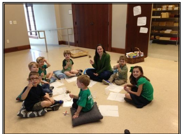
Godly Play St. Patrick Celebration

On April 5th all are invited to join in hearing the story of Easter Eggs in the Great Hall at 10:00AM. After the story, children are invited to hunt for eggs outside the Community Life Center. This year, eggs will contain tickets instead of candy. Children will count tickets and place them in jars for three designated non-profit organizations. Money will then be donated to each organization in honor of St. Mary’s children. After making their donation, children will get to choose a few pieces of candy. Following the egg hunt, resurrection related crafts will be available in the Great Hall.